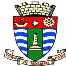
TOWN OF MOSMAN PARK