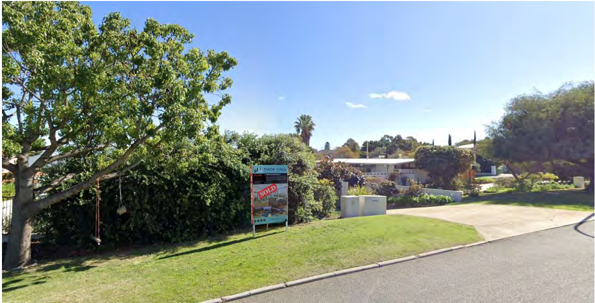
Image 3: A view in a north westerly direction of the subject site's street frontage.