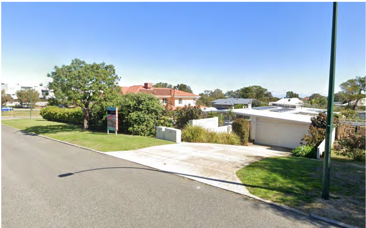
Image 2: A view in a south westerly direction of the subject site's street frontage.