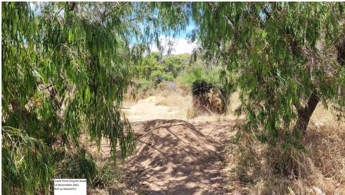
Track from Empire Road 13 December 2021 Not so beautiful