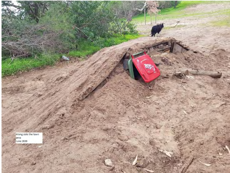
Along side the lawn area June 2020