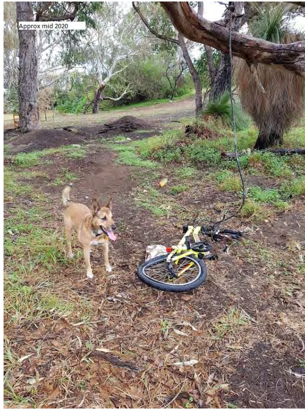
Approx mid 2020