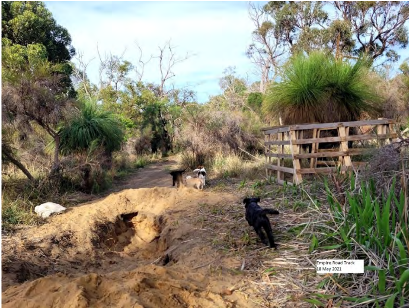
Empire Road Track 18 May 2021