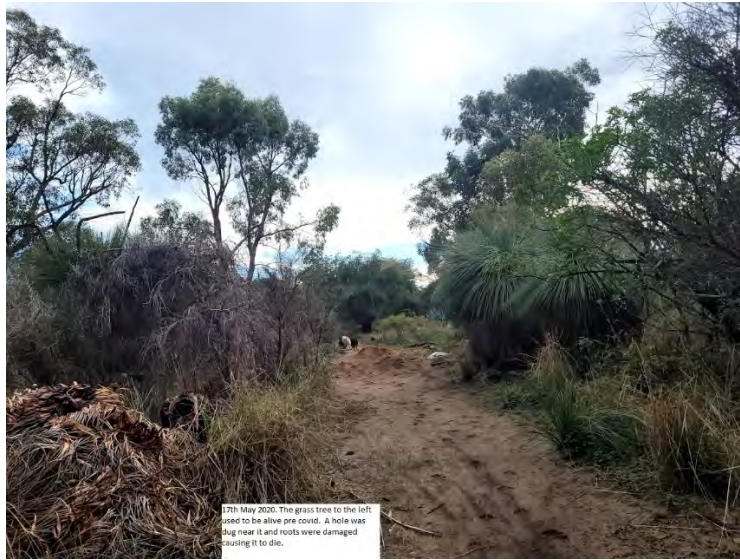
17th May 2020. The grass tree to the left used to be alive pre covid. A hole was dug near it and roots were damaged causing it to die.