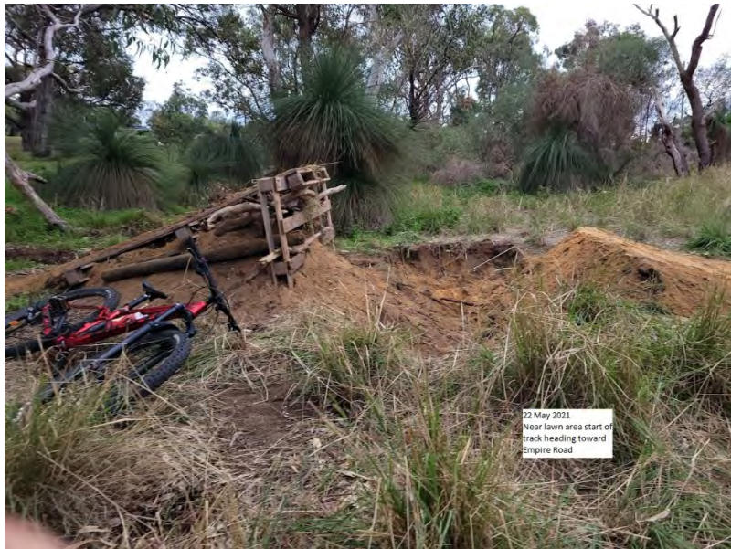
22 May 2021 Near lawn area start of track heading toward Empire Road