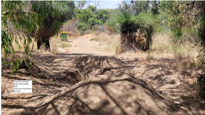
Track from Empire Road 13 December 2021. Grass trees have been cut back.