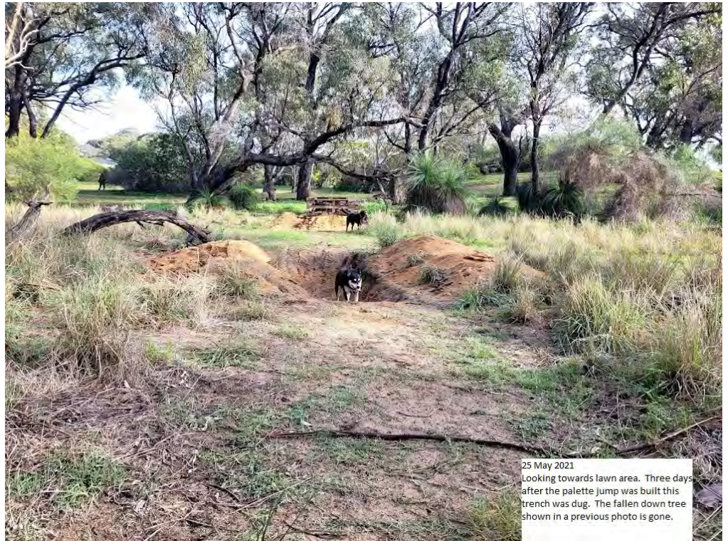
25 May 2021 Looking towards lawn area. Three days after the palette jump was built this trench was dug. The fallen down tree shown in a previous photo is gone.