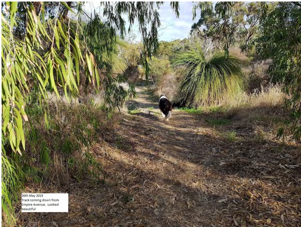
26th May 2019 Track coming down from Empire Avenue. Looked beautiful