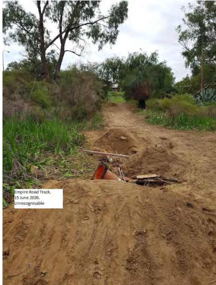
Empire Road Track, 15 June 2020. Unrecognisable