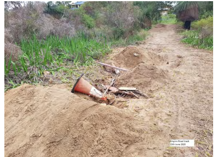
Empire Road track 15th June 2020