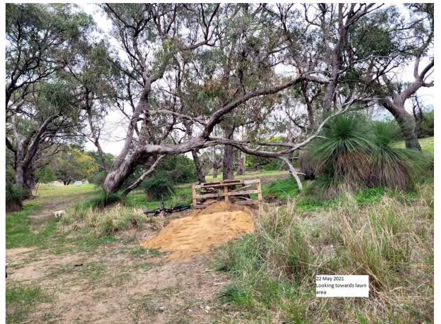
22 May 2021 Looking towards lawn area