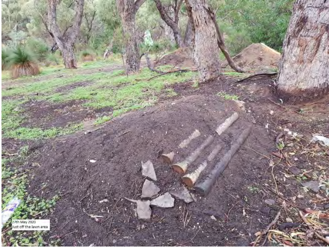
17th May 2020 Cut off the lawn area