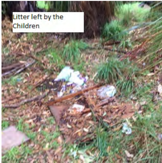
Litter left by the Children