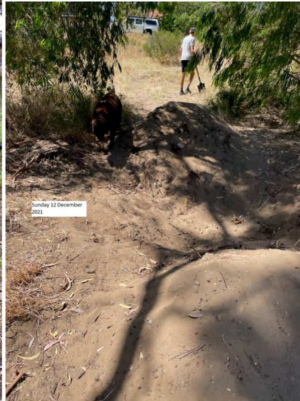
Sunday 12 December 2021