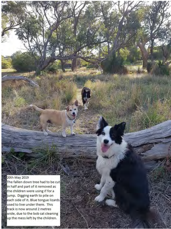
20th May 2019 The fallen down tree had to be cut in half and part of it removed as the children were using it for a jump. Digging earth to pile on each side of it. Blue tongue lizards used to live under there. This track is now around 2 metres wide, due to the bob cat cleaning up the mess left by the children.