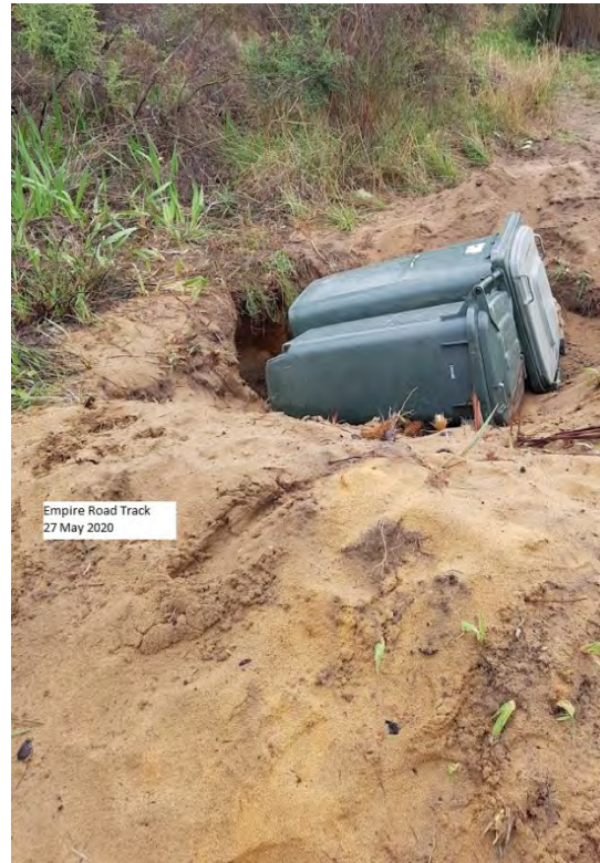
Empire Road Track 27 May 2020