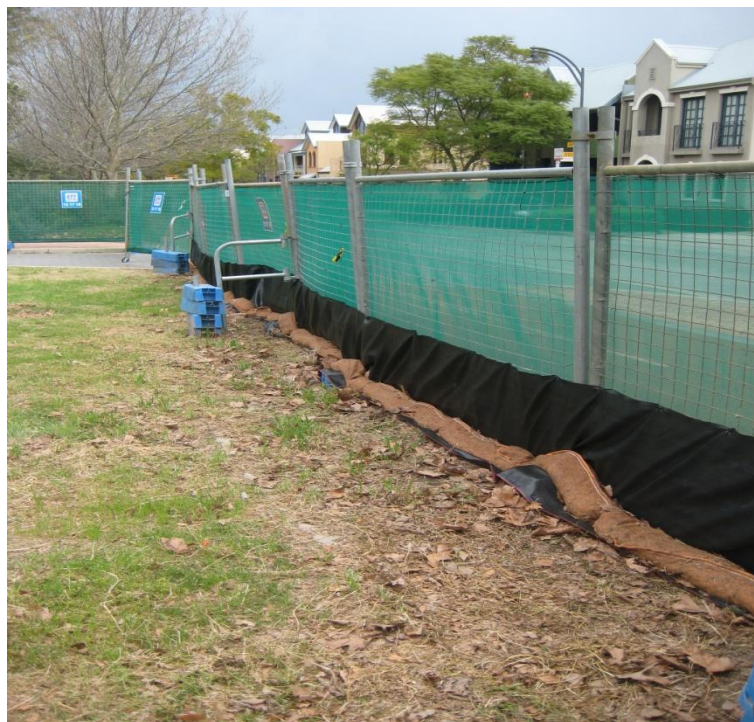
Figure 3: Side view showing fence with geotextile fabric secured to the ground.

It is necessary to secure the geotextile material at the base of the wire mesh fence to prevent sediment passing underneath the fence. The preferred method for doing this is to place the lower 200 mm (minimum) part of the fabric on the ground facing into the construction site, and buried under a 100 mm layer of coarse aggregate in a filter roll or silt sock (Figure 3). If permitted, another option is to bury the geotextile material in a trench to a minimum depth of 200 mm.