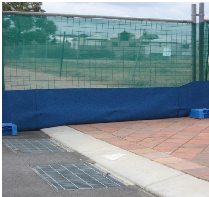
Figure 2: Front view showing sediment control fence protecting stormwater drains.

The sediment control fence enables water to pass through, but traps sand and other coarse material before it washes into the stormwater drainage system (Figure 2).