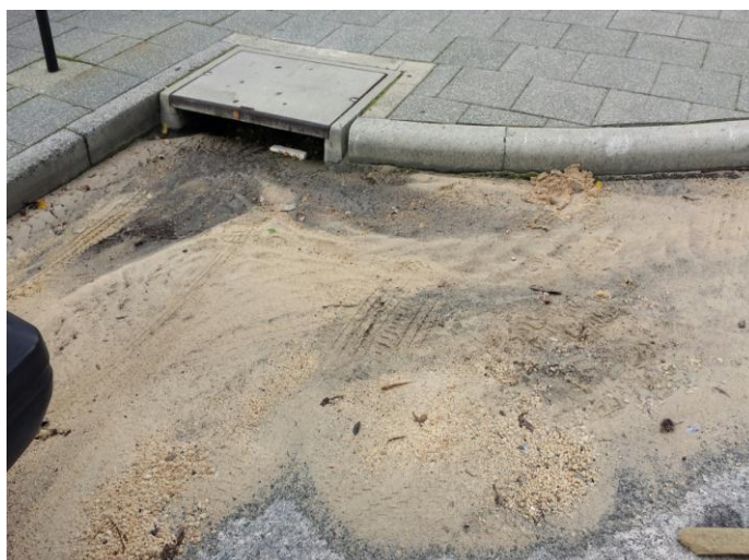
Figure 1: Build up of sand washing into side-entry drain

Aside from environmental factors, sand drift from development sites can also result in dust, causing a nuisance to neighbouring properties. The costs associated with remediation of the impacts of sediment drift can be considerable.