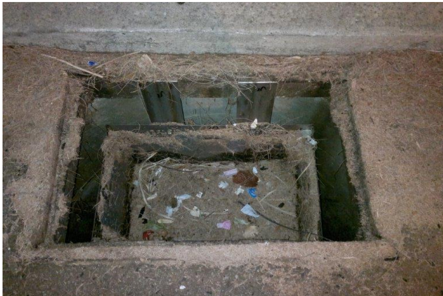
Figure 5: Stormwater drain insert to collect sediment